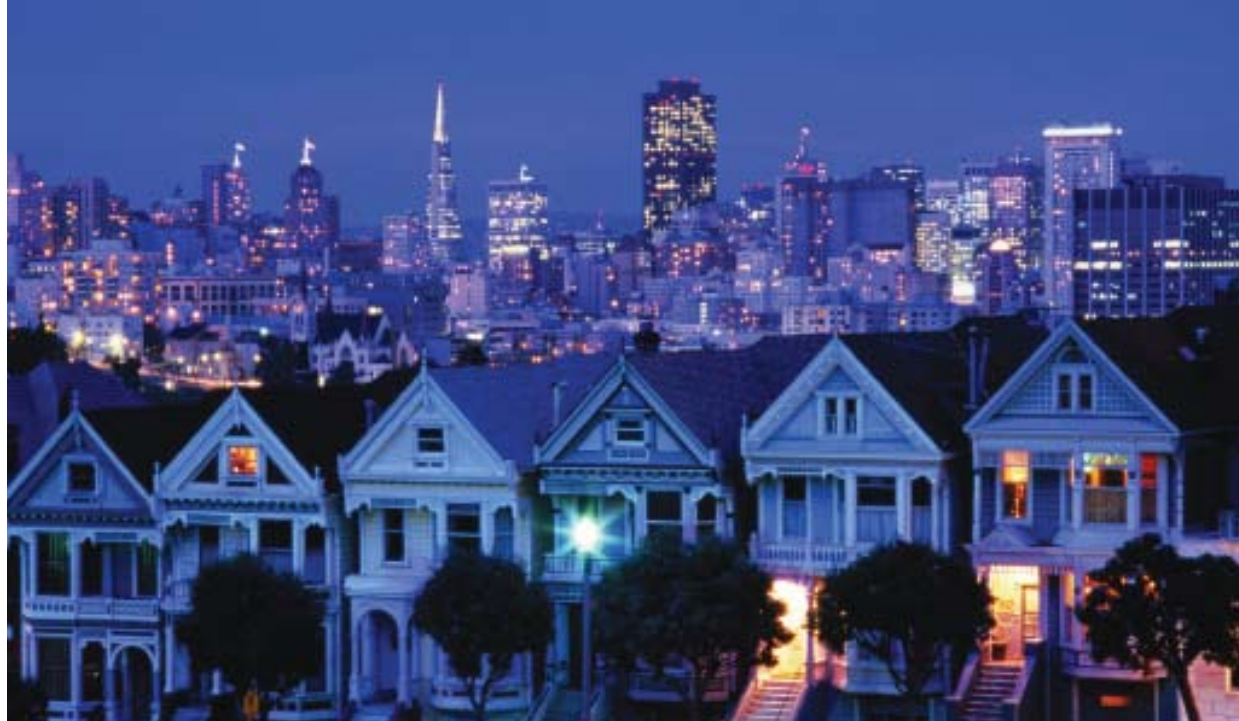
See the stately Victorian homes of Alamo Square, San Francisco

The lively cities of San Francisco and Los Angeles contrast with the beauty of the California coast and majesty of Yosemite.