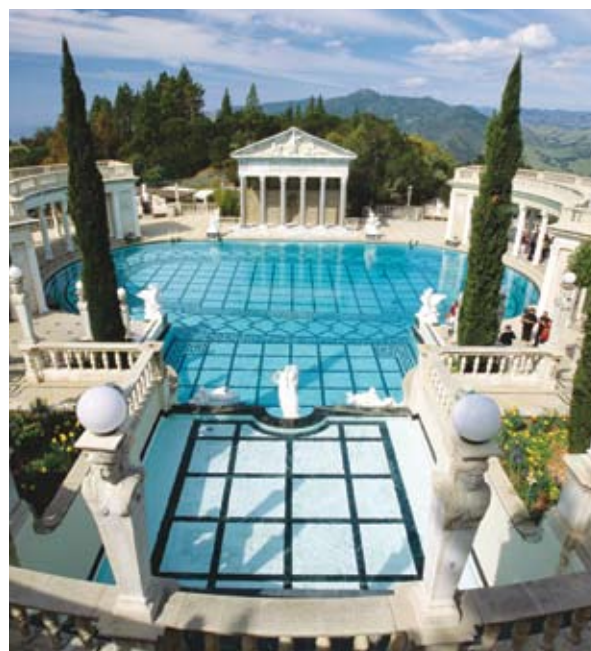
Neptune Pool, Hearst Castle