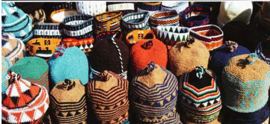
Opposite page: One of the 9000 streets of the great medina in Fez, Morocco's oldest imperial city, founded in 790AD. Above: The kasbah of Ait Benhaddou, the oldest fortified citadel in the Atlas Mountains and the location of many films, including John Huston's The Man Who Would Be King , with Sean Connery and Michael Caine. Left: A stall of bright woven hats. Below: A local post office.