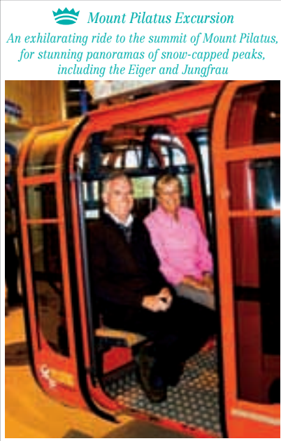
Mount Pilatus Excursion An exhilarating ride to the summit of Mount Pilatus, for stunning panoramas of snow-capped peaks, including the Eiger and Jungfrau